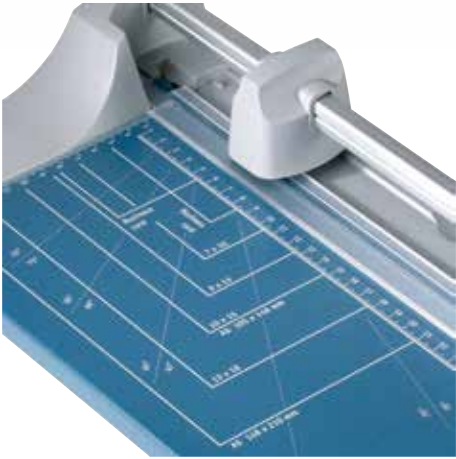
Practical format lines facilitate alignment of the item being cut