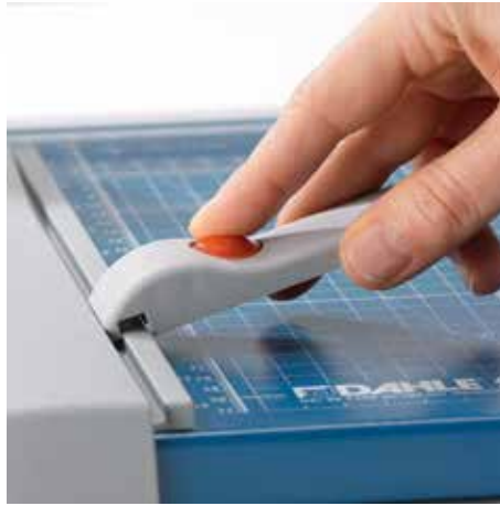
Adjustable backstop for quickly finding the right format can be used on both scale bars