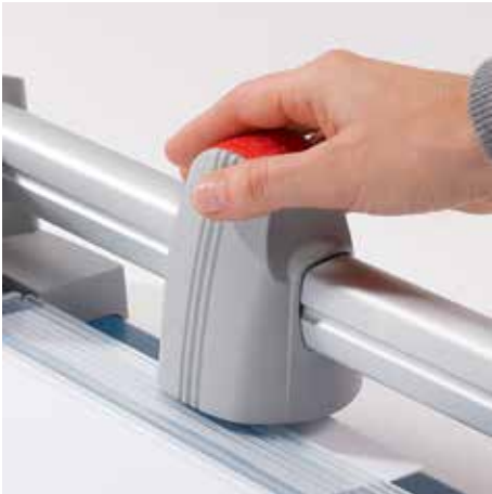
Ergonomic cutting head for convenient cutting-machine operation