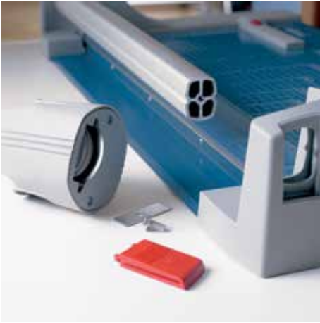
Easy-to-change cutting head to keep work processes running smoothly