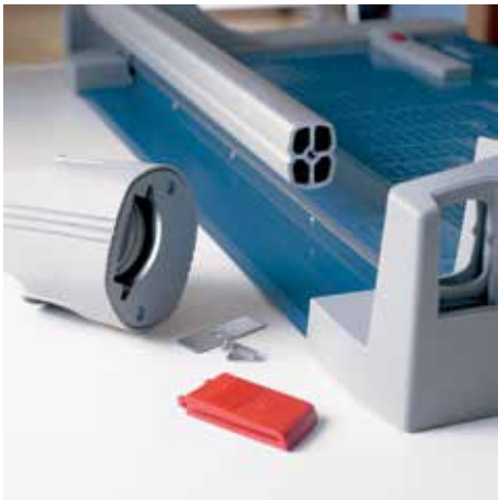
Easy-to-change cutting head to keep work processes running smoothly