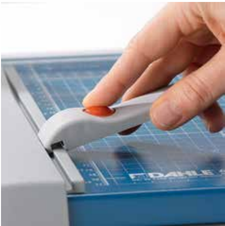
Adjustable backstop for quickly finding the right format - can be used on both scale bars