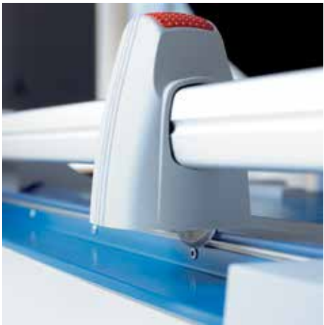
Circular blade in the sealed plastic housing provides maximum safety