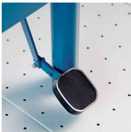
Convenient foot clamping for securely clamping large-format items