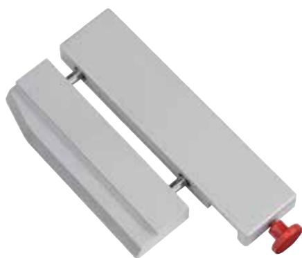
Precision narrow-strip cutting device for cutting extremely thin strips - optional