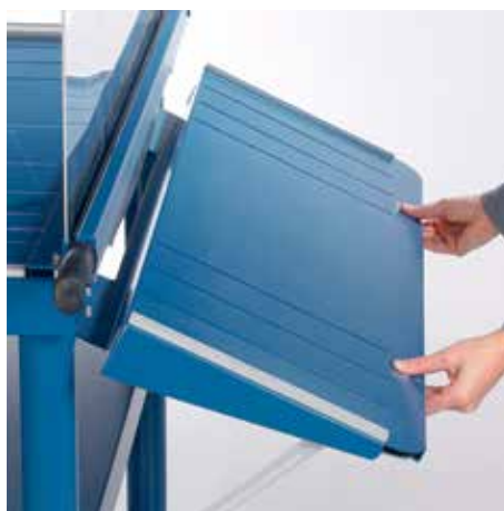
Folding front table for large-format cutting work