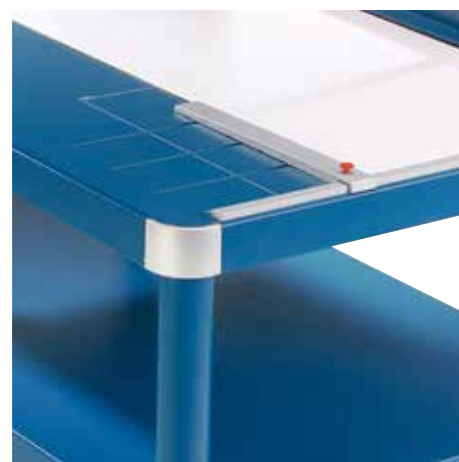
Adjustable metal backstop in guide channels for quickly finding the right format can be used on both scale bars and the front table