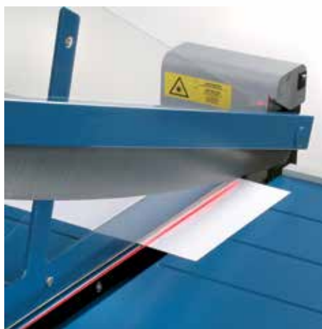
Precision laser beam line indicator for professional cutting results - optional